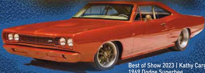
Best of Show 2023 | Kathy Cargill 1969 Dodge Superbee